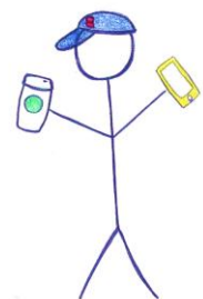
WHAT AN ACTUAL ALCOHOLIC LOOKS LIKE.